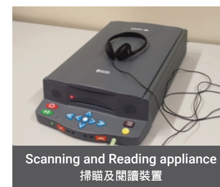
Scanning and Reading appliance 掃描及閱讀裝置