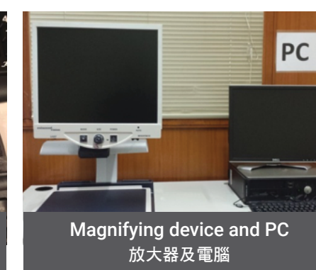
Magnifying device and PC 放大器及電腦