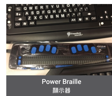
Power Braille 顯示器