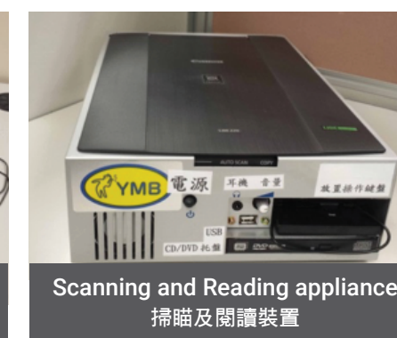
Scanning and Reading appliance 掃描及閱讀裝置